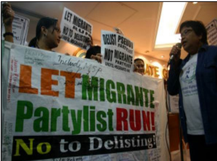
Filipino migrants expressed fears of a new wave of disenfranchisement in the coming elections. This included the delisting of Migrant, breakdown of automated elections in HK and Singapore, and fraud and violence in the Philippines.

Now that more progressive candidates are running for positions led by Rep. Satur Ocampo and Rep. Liza Maza, there is a bigger push among OFW groups in different countries to clinch more electoral victories to gain a bigger and stronger voice in venues long-monopolized by the powers that be.