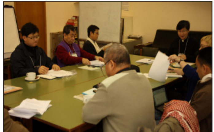
Representatives of Anglican churches and partner NGOs discussed the relevance and need of responding to problems of migrant workers. Consultation participants united on the importance of operationalizing the ARMN.

attended shared their work among migrants and refugees in their respective country. The sharing of experiences became a venue for sharing of ideas as well on how Anglican churches can further become responsive to the plight of migrants and refugees in the world.