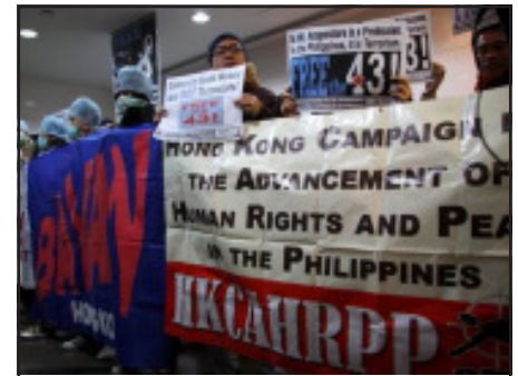
Groups worldwide condemned the continuing violations of HR in the Philippines