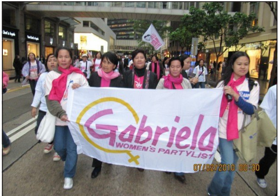
Amidst the unfriendly weather, Filipino migrants in Hong Kong welcomed with enthusiasm candidates from Gabriela Women's Party and senatorial aspirants Rep. Satur Ocampo and Rep. Liza Maza. Said candidates got the nod of many OFW groups for their record and platform of service to OFWs and their families.

Meanwhile, the condemnable crime of the Maguindanao Massacre has showcased electoral violence that has pervaded the system. Progressive party-list groups such as Bayan Muna, Gabriela, Anakpawis and Kabataan have also been targeted for harassment, intimidation and their members and leaders have also been killed or forcibly disappeared. Mass organizations that support them have also been subjected to gross human rights violations.