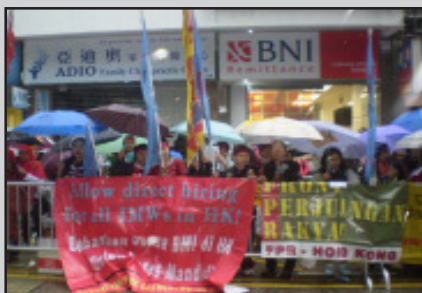
Indonesian migrants intensify actions against neglect

ATKI vowed to continue its education for all Indonesian migrants to expose the true nature of the government and to organize themselves to protect their rights both in Hong Kong and their families back home. ☺